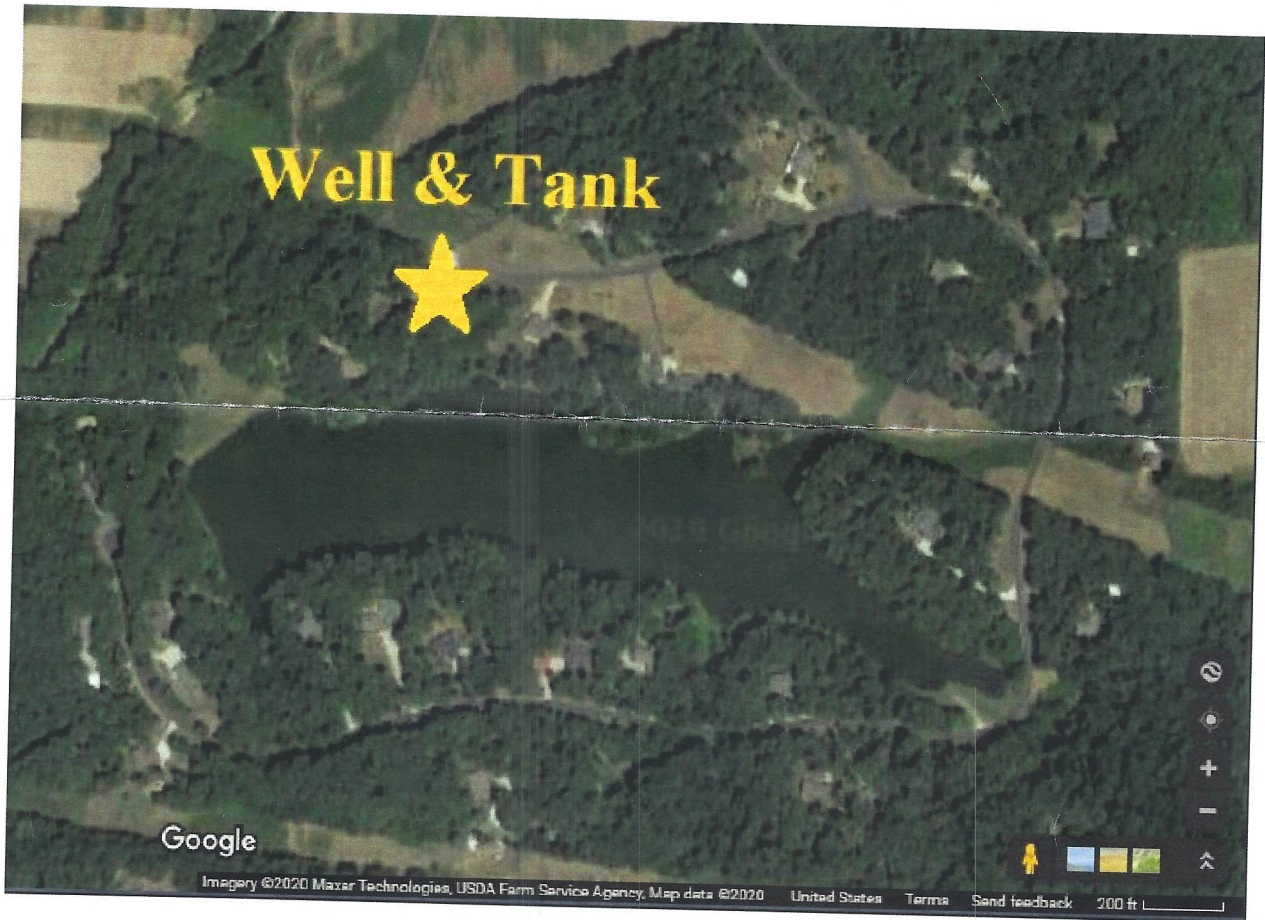
Figure 1: Overhead view of the system.