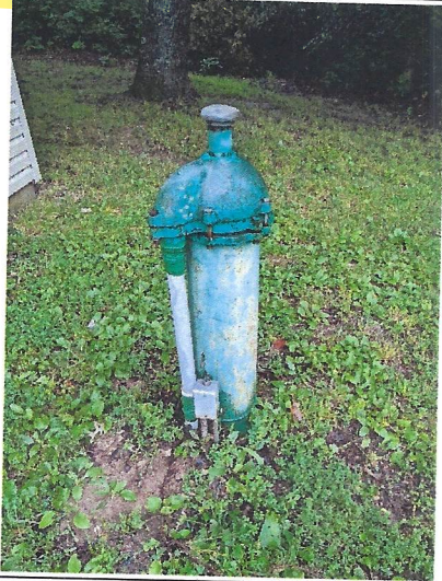
Photograph: # 2. Date Taken: July 27, 2022 Program: PDW